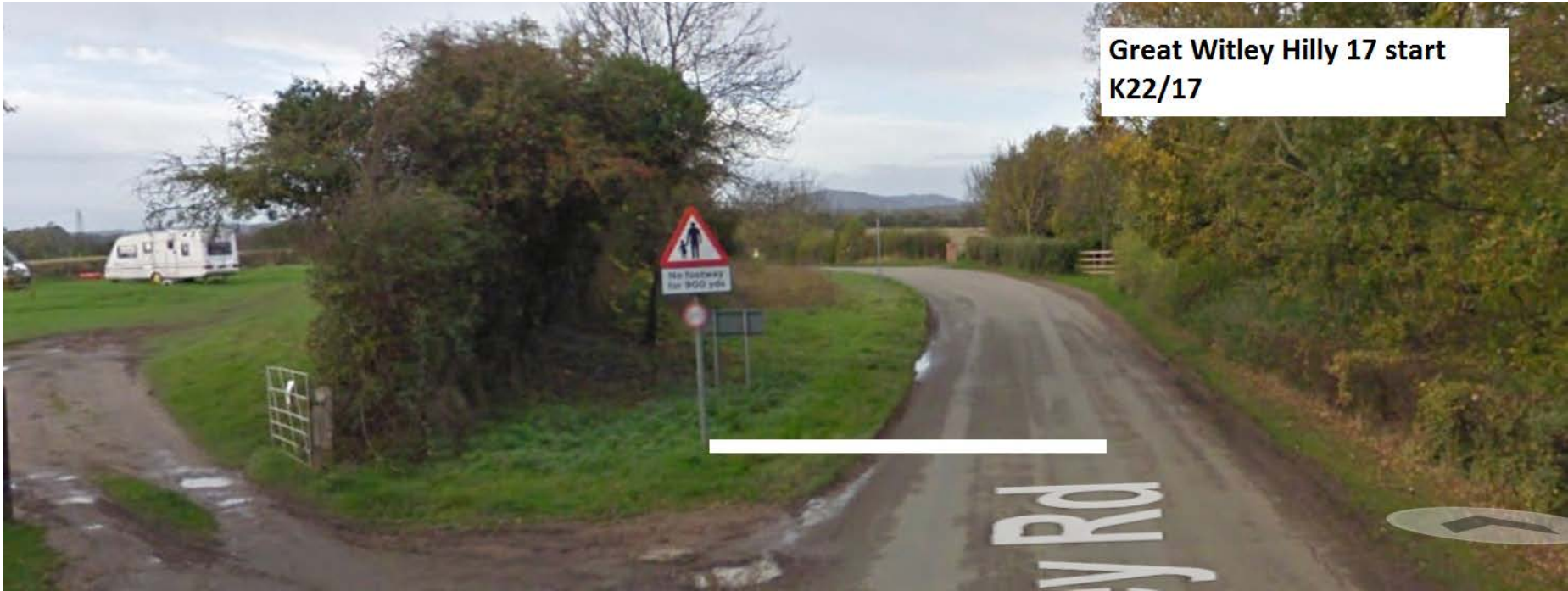
Great Witley Hilly 17 start K22/17