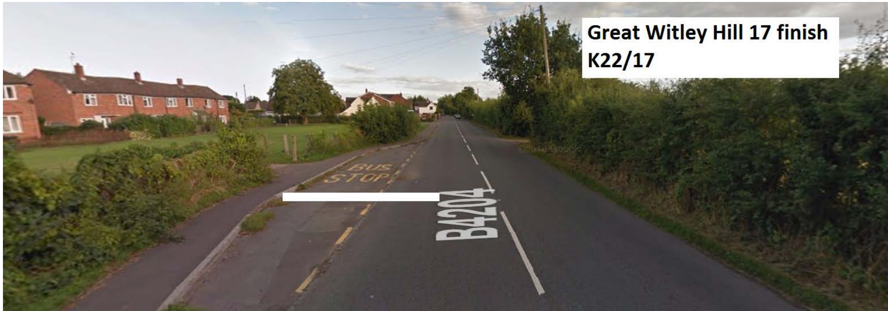
Great Witley Hill 17 finish K22/17